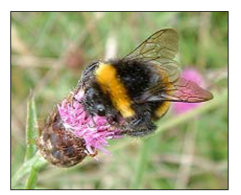
Buff-Tailed Bumble Bee

There are twenty five species in Britain: 14 are true bumble bees which nest in old mouse holes; 5 are carder bees which nest on the surface of grassy mounds and the other six are cuckoo bees, so called because they are parasitic, living in the nests of bumble and carder bees. Only six of the species are still common. Most are rare or on the brink of extinction.